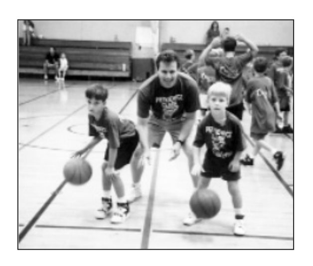
Ball handling drills to develop confidence