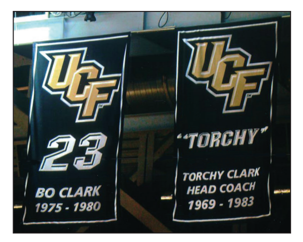
Father-Son jerseys hanging from the rafters at UCF.